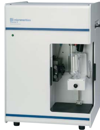
Micromeritics Elzone II

the electrolyte containing the particles is analyzed.