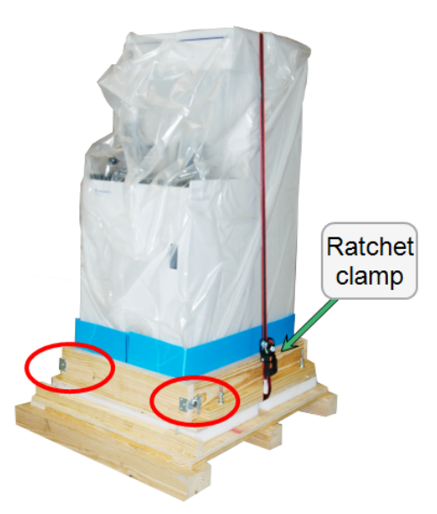
Hinged metal flaps Blue packing material is for AutoPore instruments only

There are two hinged metal flaps at the front base of