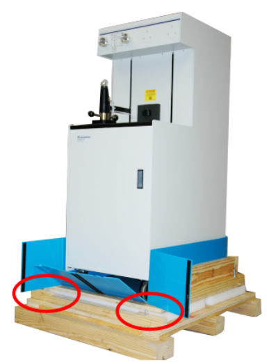
Support studs for ramp