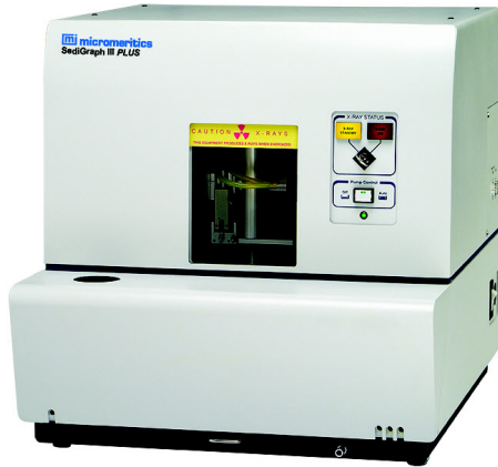
SediGraph III Plus