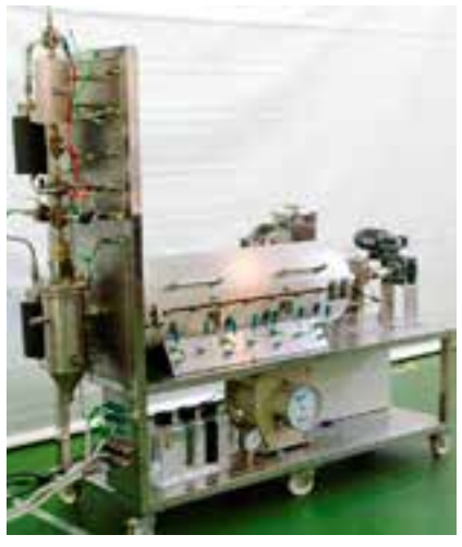
Horizontal Reactor for Slow Pyrolysis