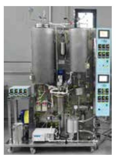
Catalytic cracking of Plastics