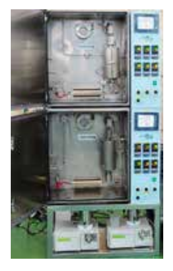
Reforming and Prox in Microchannel reactor