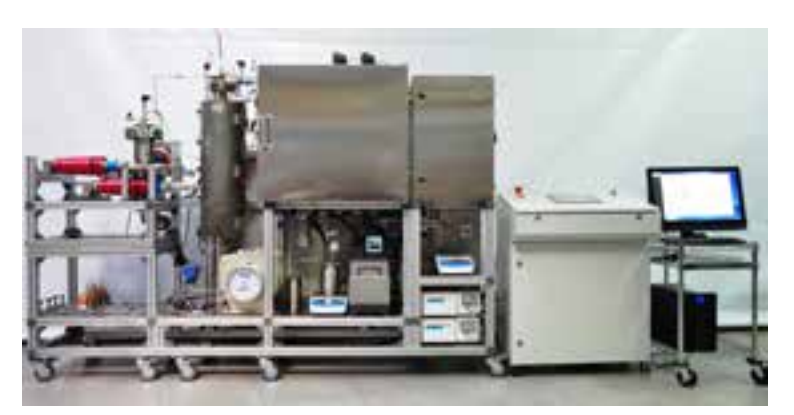
Multipurpose Hydroprocessing Pilot Plant with Solid Feeding at High Pressure