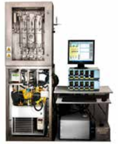
Simulated Moving Bed Reactor