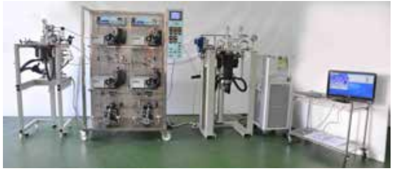
Hydrates Pilot Plant