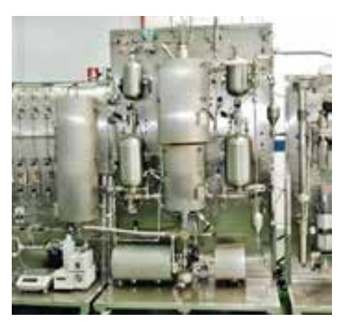
High Pressure Co-Gasification with recirculation