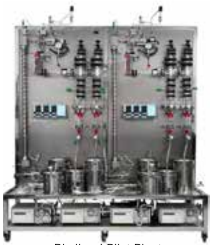
Biodiesel Pilot Plant