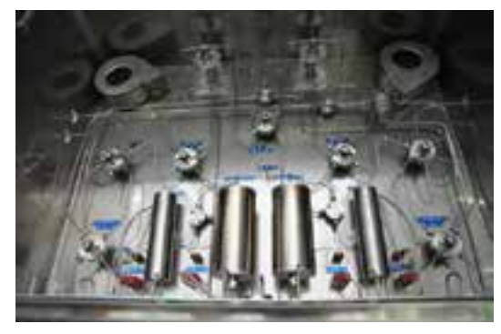
Multi Purpose Pilot Plant