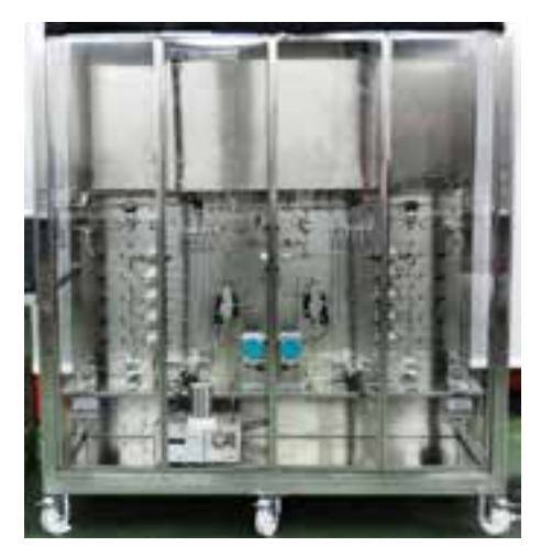
Multipurpose fixed bed reactors pilot plant with transparent enclosure